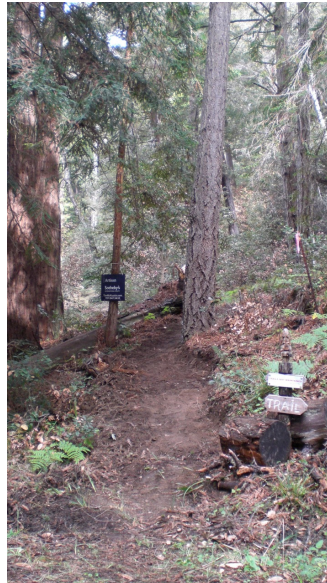
Smith Ct. trailhead for Umland-Smith Ct. Trail