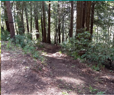
Scenes along the Umland-Smith Ct. Trail