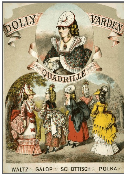
Sheet Music for balls, 1872

...The music, like the ball and supper, was a splendid success. Dancing was kept up till broad daylight, when all separated well satisfied.