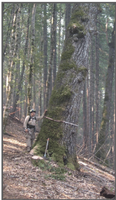
Tanoak in Six Rivers National Forest, near Somes Bar, California

It is called tanoak because of the rich amounts of tannin in the bark, which was almost its undoing, unfortunately. Tannin was used for centuries to convert hide into durable leather and during the settlement era tanoaks in California nearly disappeared due to over harvesting. What saved them was that the leather industry switched to more modern and less expensive tanning agents like sodium sulfate, calcium hydroxide, and other acids and liming agents.