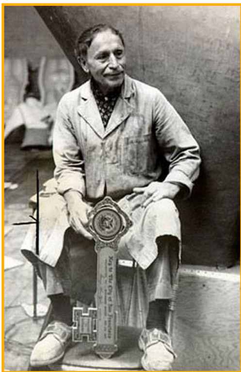
Bufano in his studio with model 1963 (note missing digit)

suggested that he clear that with President Dwight Eisenhower. A sincere letter to the U. S. President elicited only a form letter in response. It is this frustrated vision, vetoed by both a premier and a president, that began to materialize on the northern California coast in the old logging community of Timber Cove four years later.